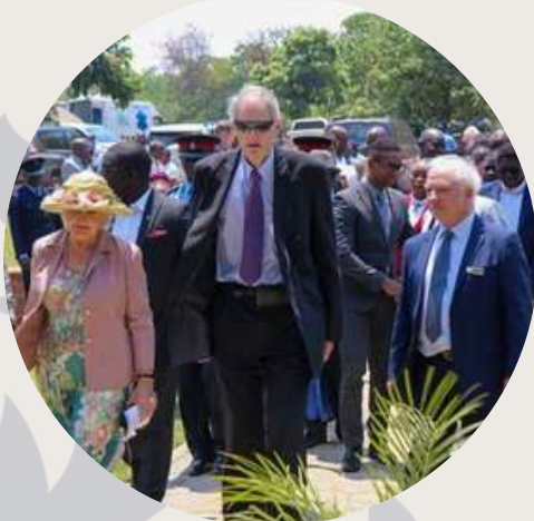
THE PHILIP PASCALL CHAPEL AND HALL A BEAUTIFUL GEM